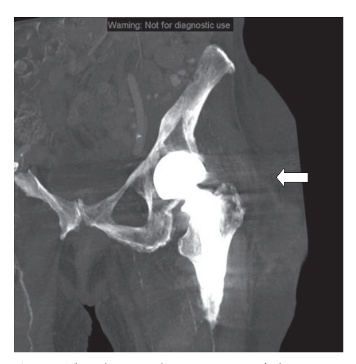
Figure 1. Three-dimensional reconstruction of the patient's left hip demonstrating the sinus tract communicating from the prosthetic hip replacement to the skin, as indicated by the arrow.

Superficial wound cultures grew methicillin-sensitive Staphylococcus aureus (MSSA). Deep cultures from the initial ultrasound-guided aspiration fluid and the intracapsular synovium grew lactobacillus species, eventually identified as Lactobacillus casei and L. paracasei . The isolate was sensitive to penicillin, gentamicin, erythromycin, clindamycin, and linezolid but resistant to vancomycin. The antibiotic regimen was changed, and she completed 4 weeks of intravenous penicillin G followed by a prolonged course of suppressive therapy with oral